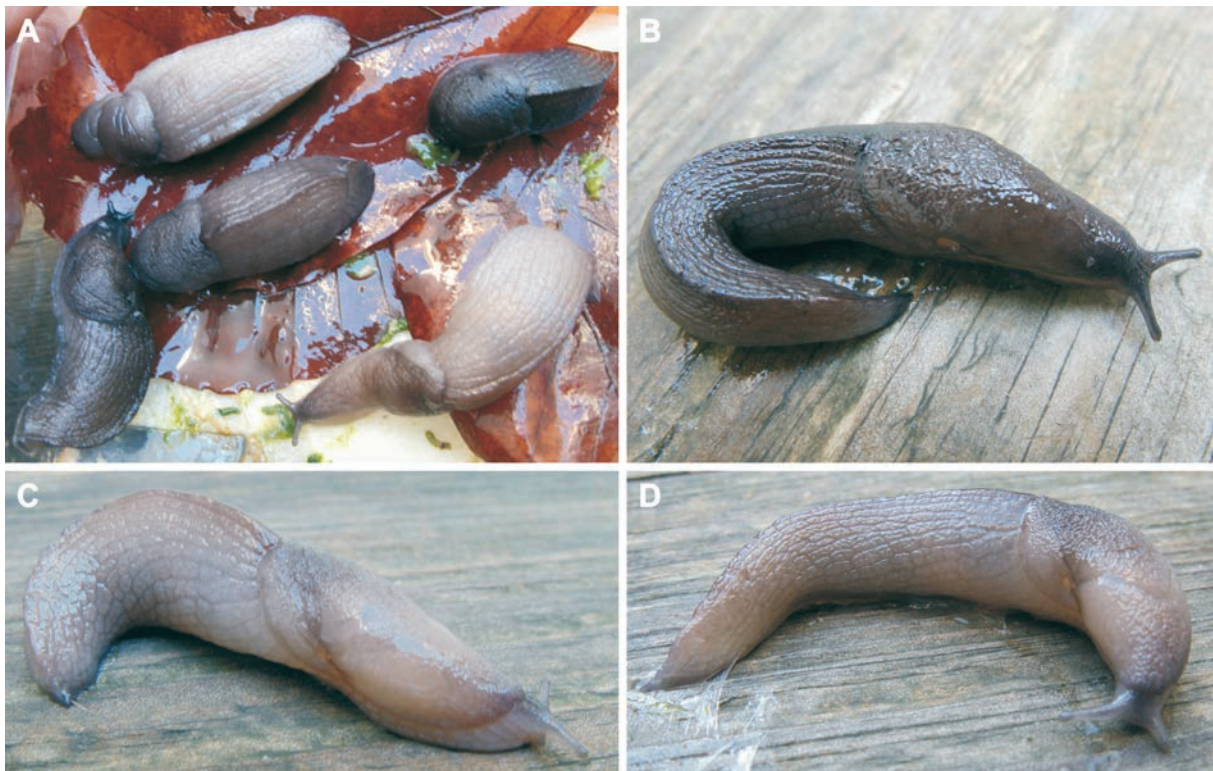
Fig. 1: A sample of Milax nigricans from Cala di Luna, Sardinia (40.2243° N / 009.6226° E; under stones on short turf in river valley; coll. Oct. 17 th 2009, photographed Nov. 6 th 2009, collection number p17842, SMNG). A demonstrates the variation in coloration; some of these individuals appear in more detail in B-D. Identification was based on internal anatomy.

The Dunkirk locality is only 3 km from the coast, so the maritime influence on the local climate may have helped this Mediterranean species to persist through winter. Over the 10 years preceding our second finding, the coldest recorded by a weather station at Koksijde, 21 km away and a similar distance from the coast, was -10° C ( http://www.wunderground.com ). This occurred between our two visits, so the population survived this bout of cold weather.